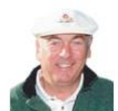
Endorsed by Christy O'Connor